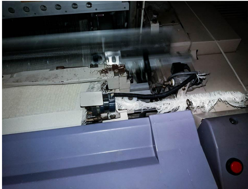
Figure 7: Weft cut fringe waste is guided to the basket

Calculation of Auxiliary Selvedge Wastage: