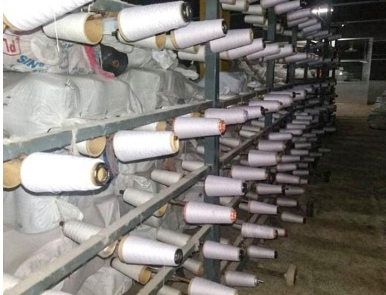
Figure 1: Residual yarn left in the creels after warping as wastage/gara

The calculation of a particular quality (Sl. No. 1 in Table 2) is described below: