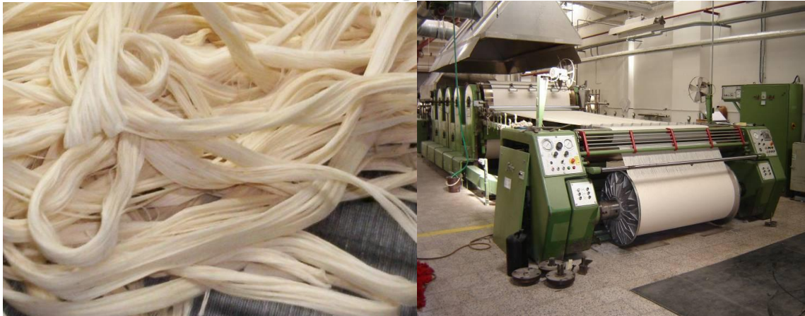
Figure 2: Warp sheet wasted during sizing (left); warp sheet wound on the weaver's beam (right)

These warp yarns are used to tie-in the warps of the next set of sizing. When the next set is started, the sized yarn of the previous set is pulled out and thrown away as waste. Figure 2 (left) shows some pulled out sized yarn. Apart from this, a substantial amount of warp sheet is also wasted at the end of sizing as residual or left over yarn on the warp beams situated in the creel section of the sizing machine.