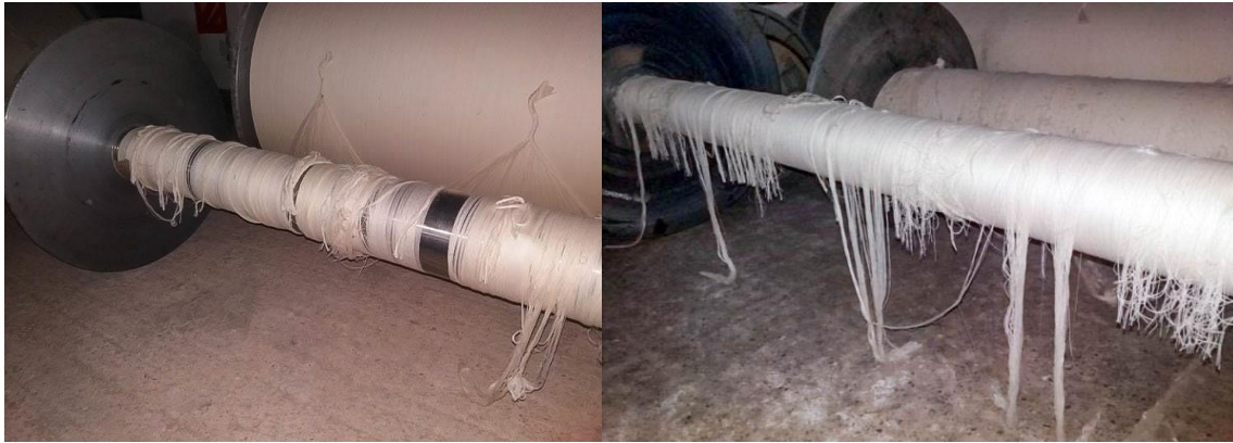
Figure 5: Residual warp yarn as residual warp waste remaining in the beam after weaving

warp sheet is considered beam residual wastage. The residual warp yarn remaining in the beam at the end of weaving is known as residual warp waste and is shown in Figure 5 .