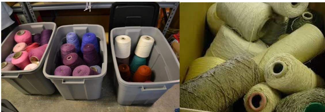
Figure 8: Wasted weft yarn cones are rejected and kept aside in separate bags

avoid rejection, these faulty cones are carefully detected and considered as wastes. Wasted weft yarn cones are rejected and kept aside in separate bags as shown in Figure 8.