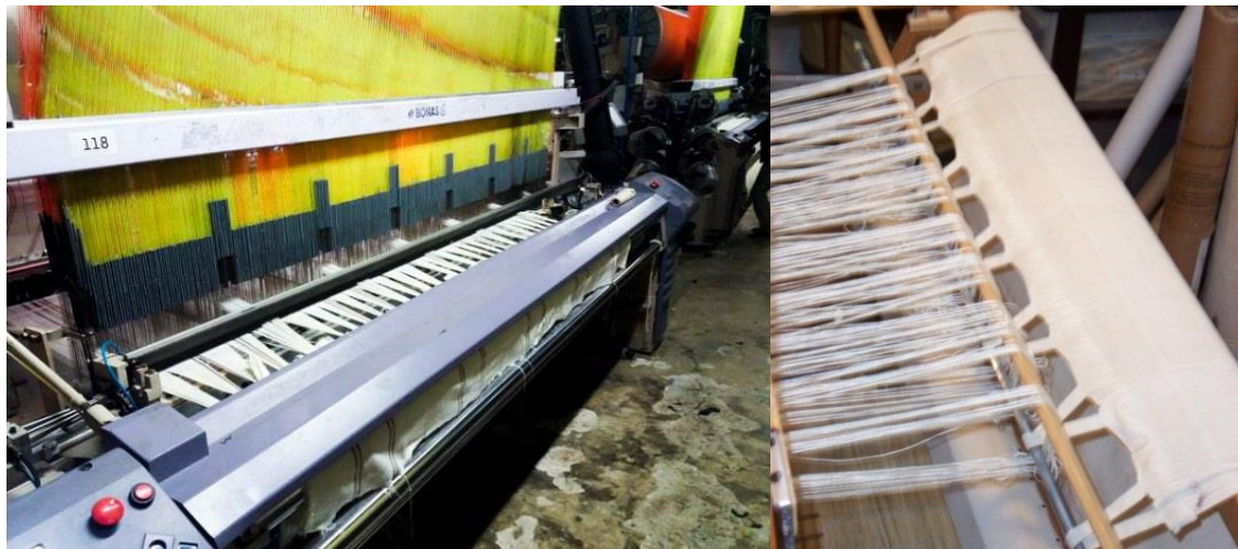
Figure 4: Warp sheet wasted while tying in and setting up the warp yarn for production

reed. After completion, the whole arrangement, i.e., weaver's beam, drop wire, heald wire set and the reed is shifted into the loom. After shifting is completed, the drop wire set, heald wire set, and the reed is secured in the loom frame. After that, the ends coming out from the reed are drawn forward and wound on to the cloth roller so that weaving can begin. Gaiting or tying in is also necessary in case of installation of a new loom, i.e., when beginning to weaving on a completely new loom. Figure 4 shows the drawing and denting process.