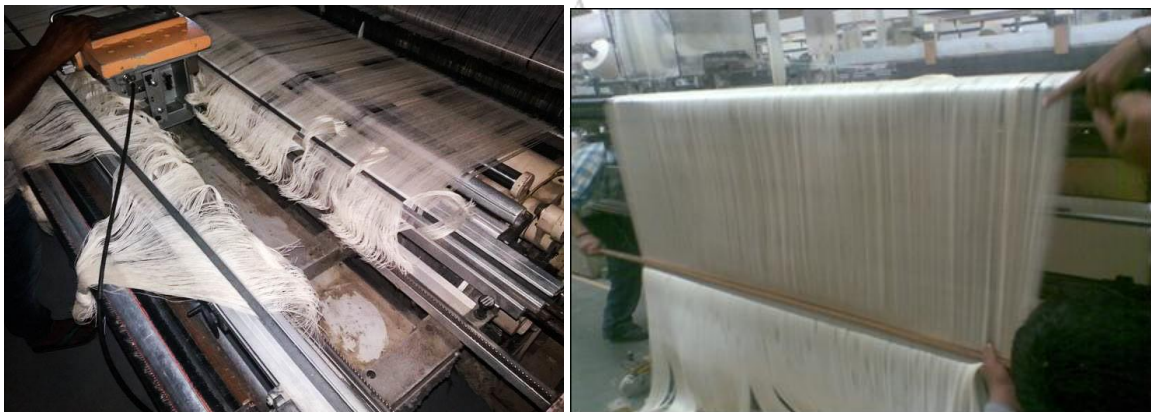
Figure 3: Warp yarn is wasted at the time of knotting operation

ends of the new beam. Such knotting eliminates the extra time and effort of beam gaiting and tying in. To perform knotting efficiently, small lengths of warp sheet from both the newly installed weaver's beam and existing warp ends (in the loom) are eliminated. This is done to ensure that all the warp ends of the two beams are available for attaching together.