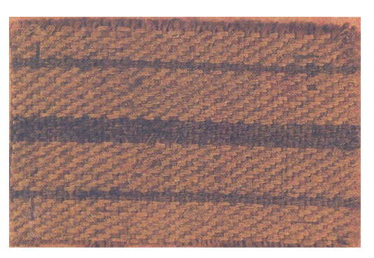
Figure 4. Banana Fiber mat