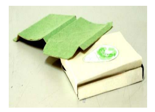
Figure 3. Banana Fiber package

However, in Japan, it is being used for making traditional dresses like kimono, and kamishimo since the Edo period (1600-1868). Due to its being lightweight and comfortable to wear, it is still preferred by people there as summer wear. Banana fiber is also used to make fine cushion covers, Neckties, bags, table cloths, curtains etc. Rugs made from banana silk yarn fibers are also very popular world over.